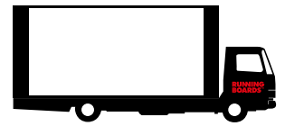
W 6.00 x H 3.00m