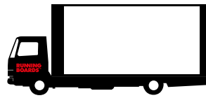
W 6.00 x H 3.00m